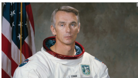
Eugene Cernan March 14, 1934 – January 16, 2017 Gemini IX, Apollo 10, Apollo 17