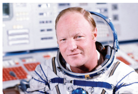
Igor Volk April 12, 1937 – January 3, 2017 Soyuz T-12