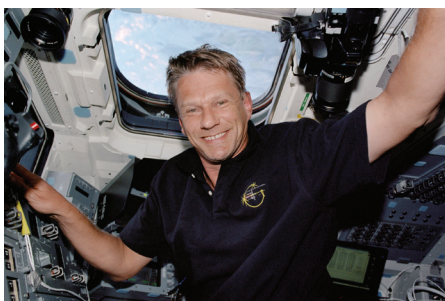
Piers Sellers April 11, 1955 – December 23, 2016 STS 112, STS 121, STS 132