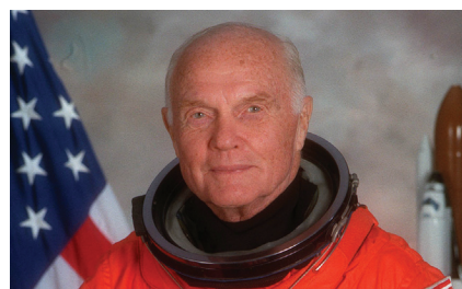
John Glenn July 18, 1921 – December 8, 2016 Mercury Atlas - 6, STS 95