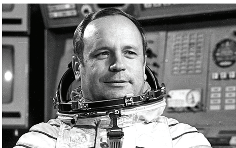
Viktor Gorbatko December 3, 1934 – May 17, 2017 Soyuz 7, Soyuz 24, Soyuz 37