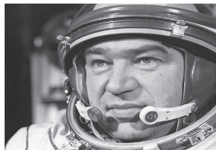
Georgi Grechko May 25, 1931 – April 8, 2017 Soyuz 17, Soyuz 26, Soyuz T-14